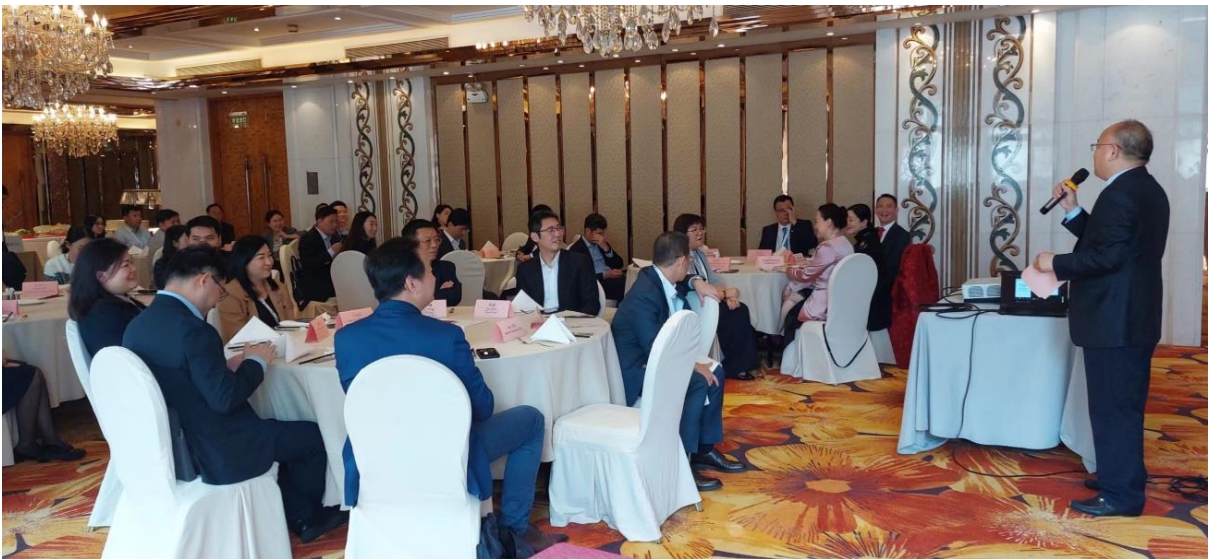
Representatives from invited Singapore firms participating in a networking session with representatives from various organisations in China.

The 15 participating Singapore firms are invited based on their internal expertise or potential to launch new innovative revenue streams, demonstrating the organisers' dedication to nurturing international networks and remaining leaders in industry advancements across accounting and legal sectors.